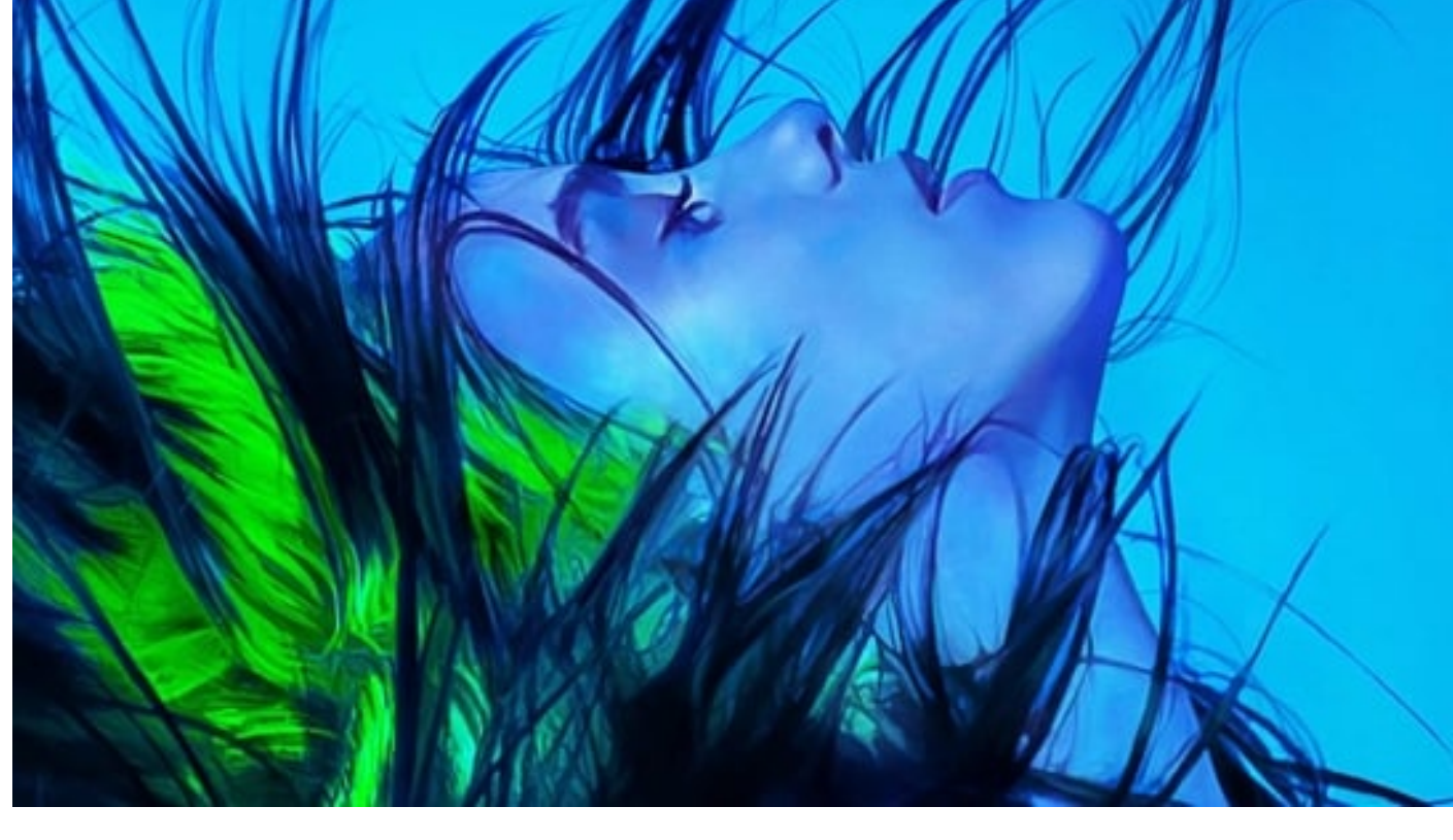
Billie Eilish The World's a Little Blurry movie review: Apple's documentary traces the meteoric rise of the music industry's most mercurial performer.

There is a moment in the 2013 Justin Bieber concert film, Never Say Never, in which Bieber physically reaches out towards the sea of fans before him. The 3D gives the illusion that the pop-star is actually within touching distance of the teenage girls who'd happily sever their fingers for the opportunity. A similar moment unfolds in Billie Eilish: The World's a Little Blurry, another documentary about a teenage pop singer's rise to the top of the pyramid, but this time, it's you that wants to reach out.